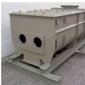
Specialist Machine Fabrication