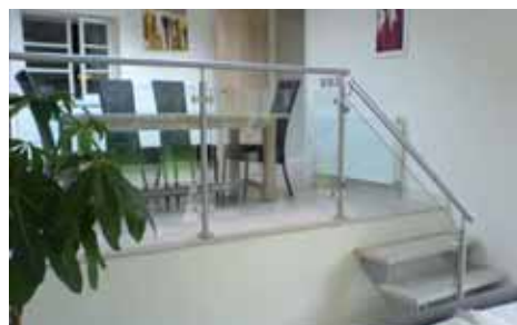
Decorative Stainless Handrail