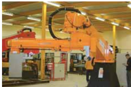
Specialist Machine Fabrication