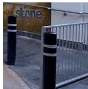
Urban Street Furniture