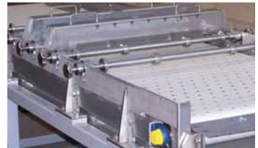
Stainless Steel Conveyor