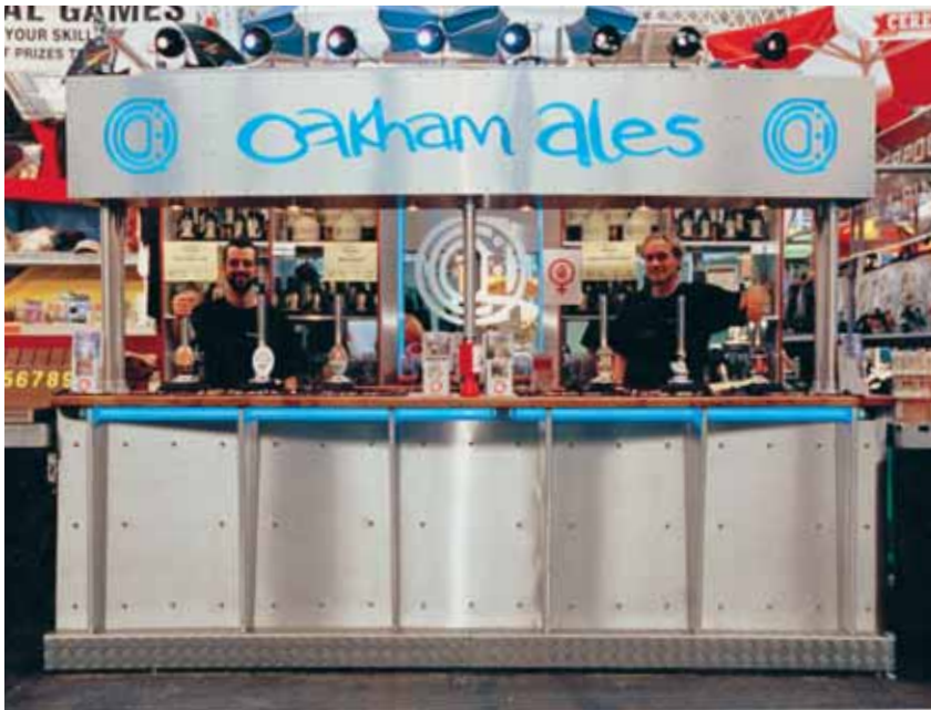
Architectural Stainless Steel Fabrication