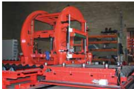
Specialist Machine Fabrication