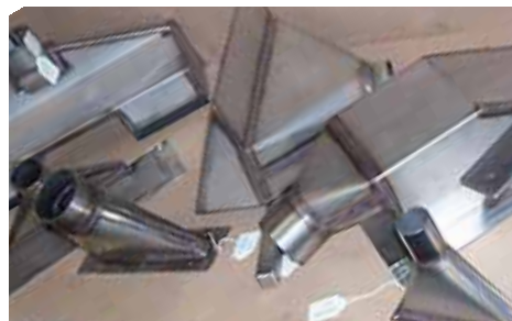
Complex Stainless Fabrications