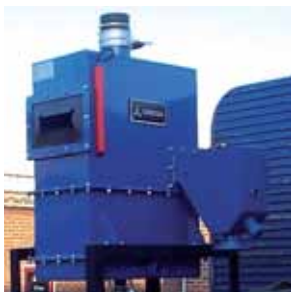
Specialist Machine Fabrication