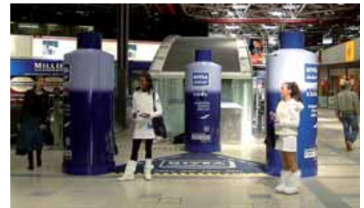
Bespoke Exhibition Equipment